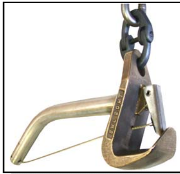
UNI-LIFT 2 MT Model 26A069