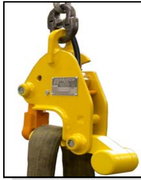
WEB-LATCH 5 MT Model: 26A081 10 MT Model: 26A083