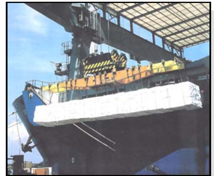
Upgrade kits or Complete Custom Designed Lifting Frames.