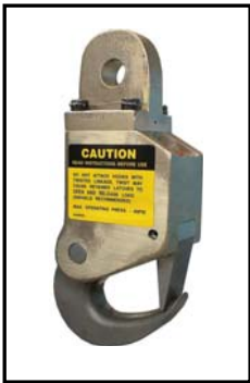
UNI-HOOK 3MT Fixed Cap Model 26A090