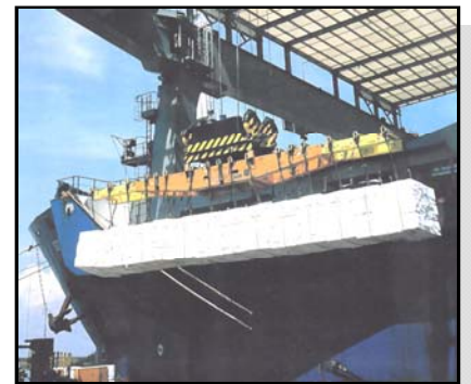
Upgrade kits or Complete Custom Designed Lifting Frames.