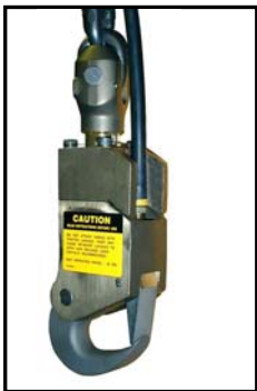
UNI-HOOK 3MT Swivel Cap Model 26A087