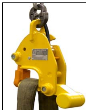
WEB-LATCH 5 MT Model: 26A081 10 MT Model: 26A083