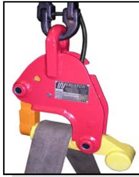
WEB-LATCH 5 MT Model: 26A081 10 MT Model: 26A083