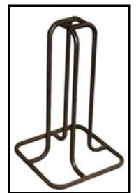
Optional Pipe Stand

D. Gooseneck and crossbar are capable of full rotation.