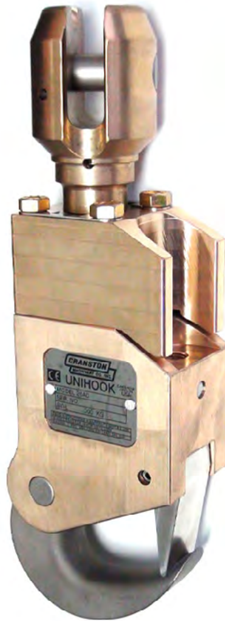
Model 26A105 and 26A107